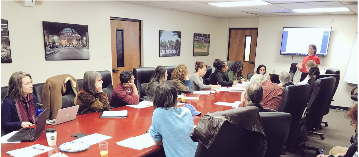
Supporter of SB 1072 having a meeting on the climates and communities